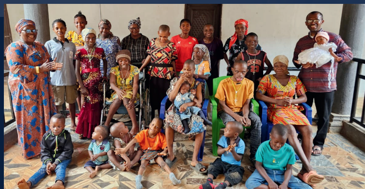
Residents in our SSB Living Center - we are family.

On November 15, 2025, I traveled to Nigeria to open our new educational facility named Alonso Academy , currently under construction. This school will start in August 2026, to serve our residents and the local villagers, offering both primary and secondary education. It is profoundly moving to know that the people of this village will soon have a functional school close by, a stark contrast to my own childhood of walking miles to attend school. At the dedication Mass of the education center, a little girl from the village approached me and said, "Father, you gave us Jesus." Her words stayed with me. I know that Christ is already present among His people, especially the poor, yet when our lives reflect God's compassion, we make His presence visible to others. You, our benefactors, bring Christ to the poor through your continued love and generosity. I humbly ask that you continue to walk with us in serving God's people and giving hope and happiness to those in most need. People may not recognize your giving, yet God sees all, even the simplest gift, and will repay you.