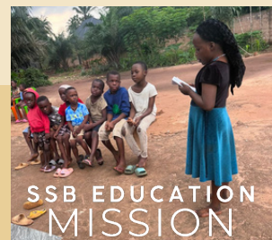
(above) Students learning at SSB outside