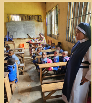
(below) Nigerian school needed like this